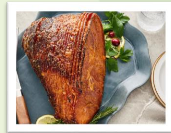
Apricot glazed ham