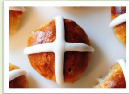
Hot cross buns