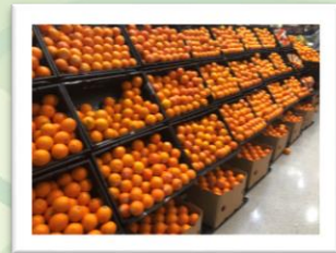
A lot of oranges